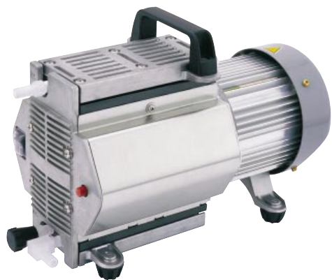
With built-in thermal protector