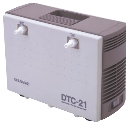
With built-in thermal protector