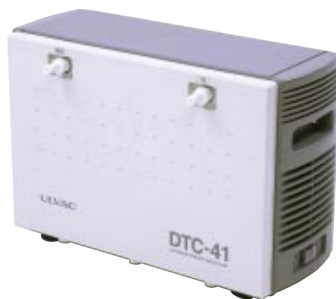
With built-in thermal protector