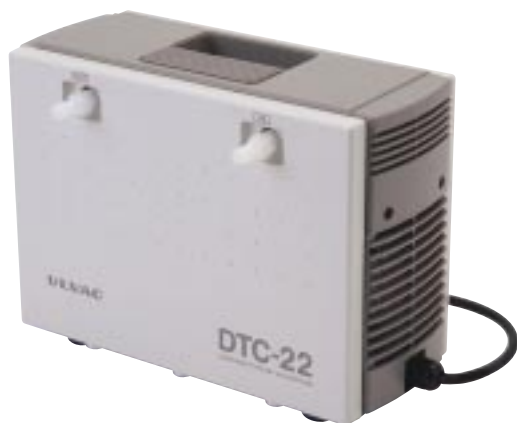
With built-in thermal protector