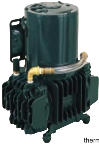
With built-in thermal protector