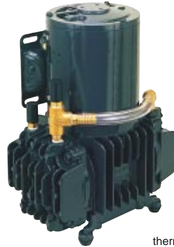
With built-in thermal protector