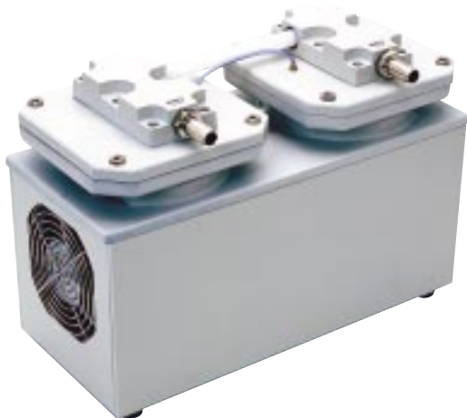
With built-in thermal protector