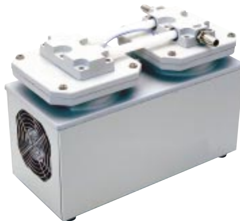
With built-in thermal protector