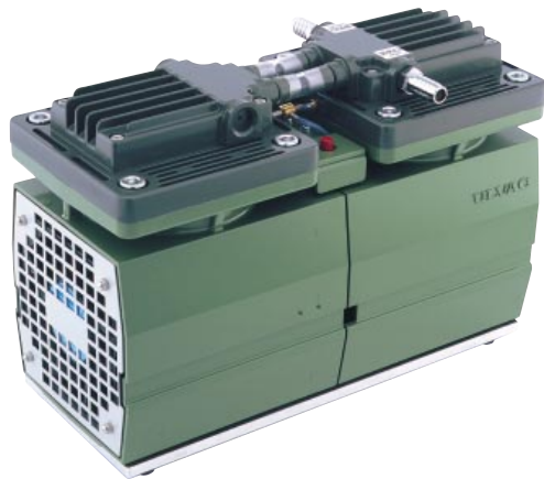
With built-in thermal protector/Unloader valve