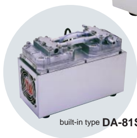
built-in type DA-81SK