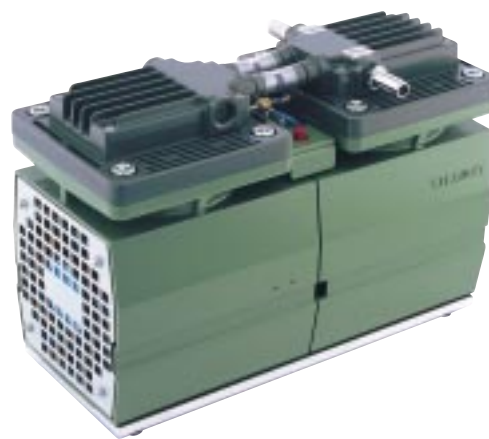
With built-in thermal protector/Unloader valve