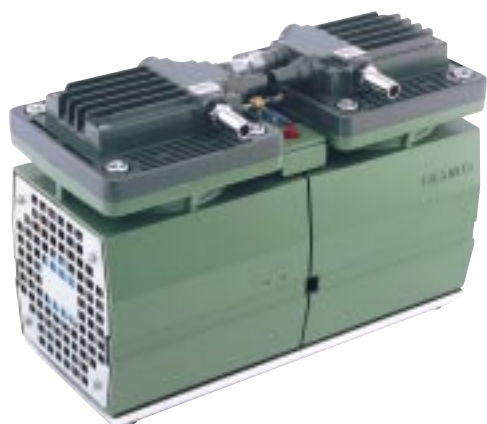
With built-in thermal protector/Unloader valve